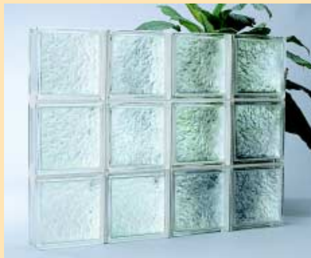
ICESCAPES® NON-DIRECTIONAL PATTERN LETS LIGHT IN WITHOUT SACRIFICING PRIVACY. MAXIMUM LIGHT TRANSMISSION WITH A MAXIMUM DEGREE OF PRIVACY.