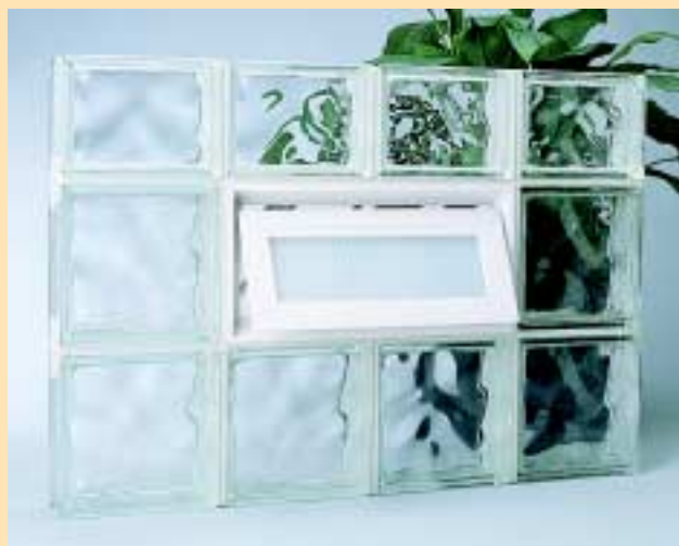
DECORA® PATTERN, WITH ITS TRADEMARK WAVY UNDULATIONS, PROVIDES MAXIMUM LIGHT TRANSMISSION WITH SUBTLE VISUAL DISTORTION.