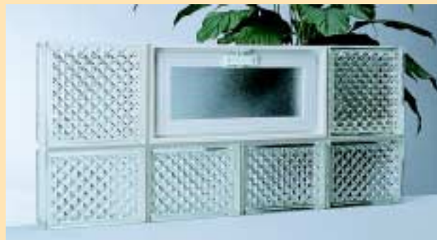
DELPHI® PATTERN, WITH PRISMATIC DIAMOND DESIGN, PROVIDES MODERATE LIGHT TRANSMISSION WITH MAXIMUM PRIVACY.

Choose from three distinct patterns, each offering its own unique style, degree of light transmission and privacy. Perfect for replacement or new-window and small-partition applications. Prefabricated panels are available with or without vents.